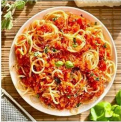
ITALIAN PASTA SAUCE

Need to save money on food bills? You can cook great food for 50p a portion!