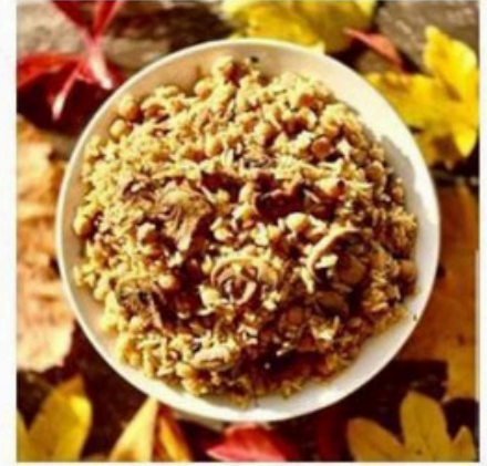
MIDDLE EASTERN PILAF

Want to learn how? It's easy, fun, completely FREE, and you can do it at home.