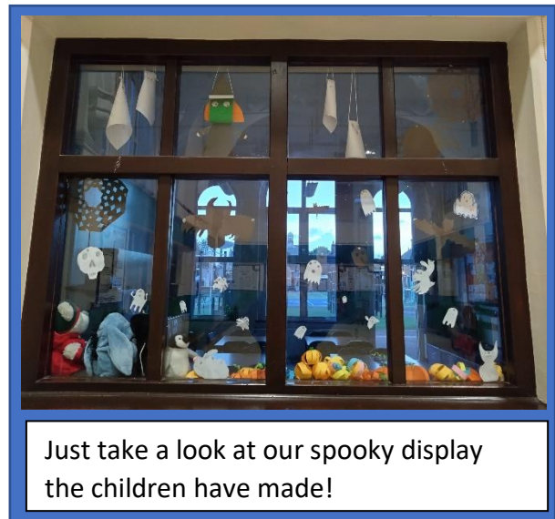
Just take a look at our spooky display the children have made!

This half-term we will be ensuring the children stay active over the Winter months with physical activities such as badminton and dodgeball. We will also be keeping their creativity flowing with our larger construction sets in the hall and seasonally inspired arts and crafts in the classroom.