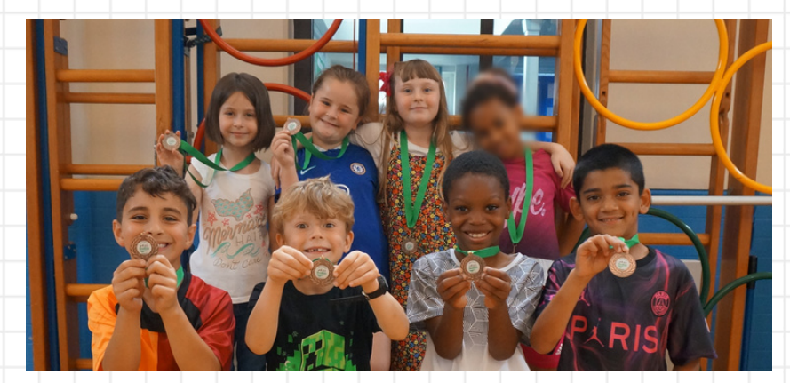
Our Year 3 squad with their bronze medals. Year 1 will receive their medals next week - some of them were on a trip today!

We are delighted to announce that two of our Quad Kids athletics teams brought home some silverware following the announcement of the final results! All of our teams from year 1 to year 6 finished in the top ten of their respective competitions out of around 30 schools. However, two of our year groups earned podium places with our year 3 children finishing 3rd, whilst our year 1 children won their competition, topping the table. Congratulations to all six teams!