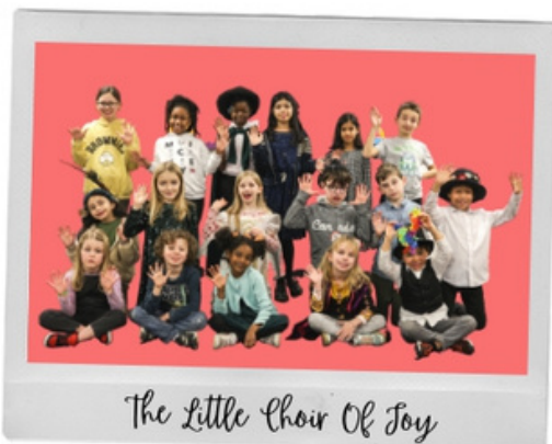
The Little Choir Of Joy

This project is in association with the ROH ' Create & Sing ' programme