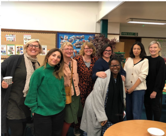
Here's some of the FoTW committee members- come and say hi to us in the playground!

We held our annual AGM on Tuesday 27th September; where we started planning the amazing causes we want to fundraise for and talked through ideas on how we can successfully do it!